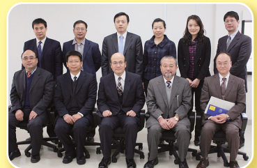
Commemorative Photo with the Research Team

In the afternoon, they exchanged information on the autumn enrollment system for transfer students, which is currently being discussed with Faculty of Engineering, to recruit students and accept foreign students. After their research, the delegation visited the site of the Fifth High School, and listened attentively to the explanations by staff about the architecture, appearance, and utilization of this red brick building which is designated as a national cultural property.