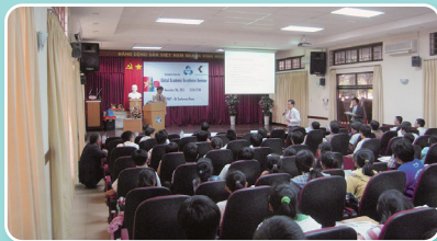
The Kumamoto University Global Academic Excellence Seminar at Ho Chi Minh City University of Technology

Following the seminars, many inquiries were made by participants regarding exchange programs, Kumamoto University, and Kumamoto in general, which reflected participants' high interest in the seminars and Kumamoto University itself. Through these seminars, we are expecting that more and more students will visit Kumamoto with the aim of participating in exchange programs, and pursuing future degrees.