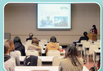
Returnee Exchange Students Presentation