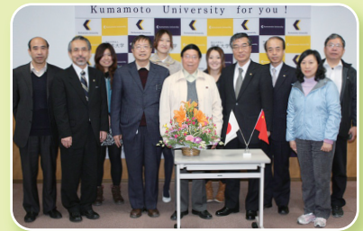
A Commemorative Picture of the Information Exchange Meeting Participants