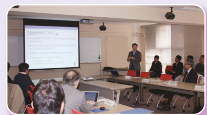
A Photo of the Presentation