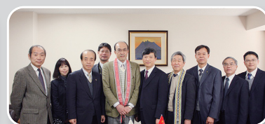
Hezhou University Delegation