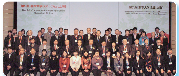
A Ceremonial Picture of the Kumamoto University Forum