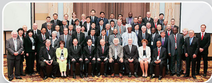
A Ceremonial Picture of the 2011 International Presidential Forum on Global Research Universities