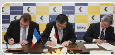
Signing Ceremony with University Joseph Fourier

It is expected that further opportunities for exchanges will be increased between the above two universities and Kumamoto University.