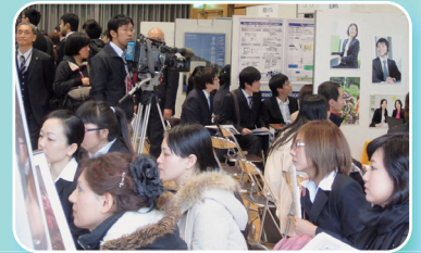
International Students listening intently to the Job Guidance Fair

15 local companies including manufacturers joined this fair, and high evaluations of the fair were also received from such companies; "We hope to utilize international resources to operate overseas, so we appreciate these kinds of opportunities." "Employing international students in local Kumamoto companies can be a benefit for companies who wish to enter into overseas markets and to promote their internal globalization." It is expected that the job guidance fair will be organized from next year as well.