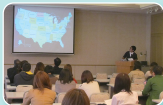
Returnee Exchange Students Presentation

About 40 students who were interested in, or planning on studying abroad participated in this session. One could hear "It was very good opportunity to hear about the study abroad experiences, and I was motivated by them."