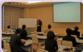
Participants at the training class

at improving Kumamoto University's International Education Program. Furthermore, we all expect the participants to further internationalize education in their respective faculties and graduate schools.