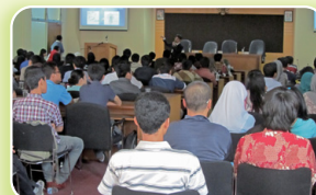
ITS students listening intently

In the seminar, we introduced our distinctive research activities at Kumamoto University. Approximately 150 students from ITS attended the seminar and listened with keen interest. After the seminar, we fielded a number of interesting questions from the audience, which highlighted their keen interest both in the seminar and in Kumamoto University. The seminar has given us hope for an increase in Indonesian exchange students coming to Kumamoto University in the future.