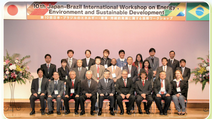
Commemorative photo of speakers and people involved