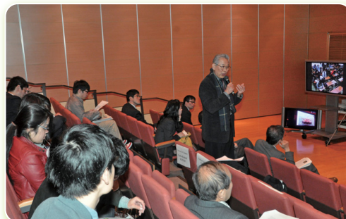
Active discussions by the participants: the workshop was delivered to Gifu University via the teleconference system (right)